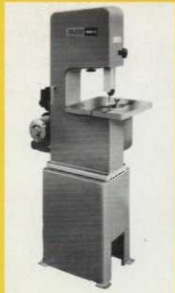
Cabinet base for floor mounting.

STARTRITE, BRITAIN'S LARGEST SUPPLIERS OF BANDSAWING MACHINES.