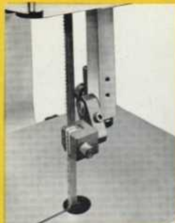
Specially developed saw guides ensure highly accurate cutting.