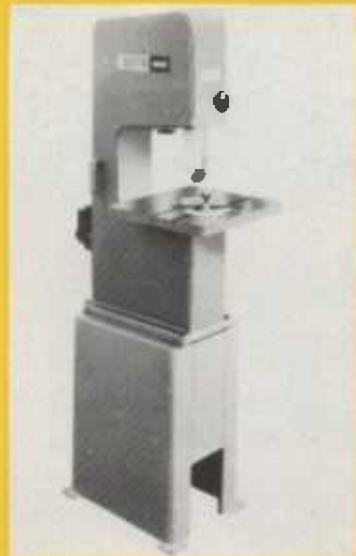
Machine mounted on cabinet base.

STARTRITE, BRITAIN'S LARGEST SUPPLIERS OF BANDSAWING MACHINES.