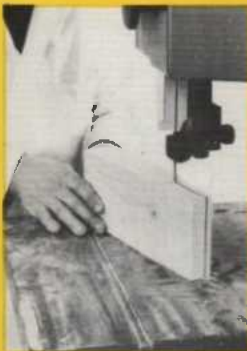
Contour sawing 4" thick timber.