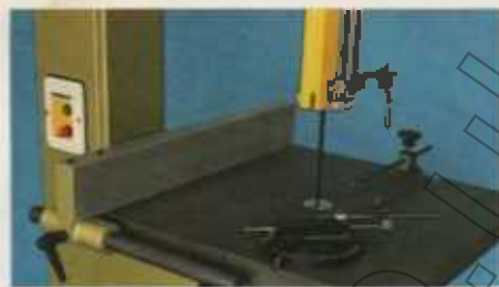
Table Showing Optional Accessories

Heavy close grain cast iron table with deep flanges for strength, fitted with an optional large rip fence, allowing straight and accurate cuts and includes depth stop. The mitre gauge is adjustable up to 60° in either direction and allows compound angles to be cut when used in conjunction with the tilting table. A circle cutting attachment makes the cutting of accurate discs easy.